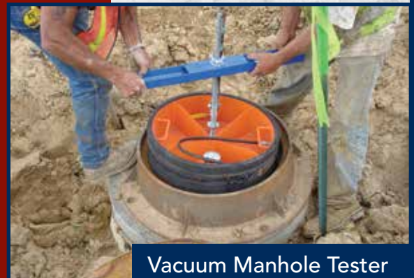
Vacuum Manhole Tester