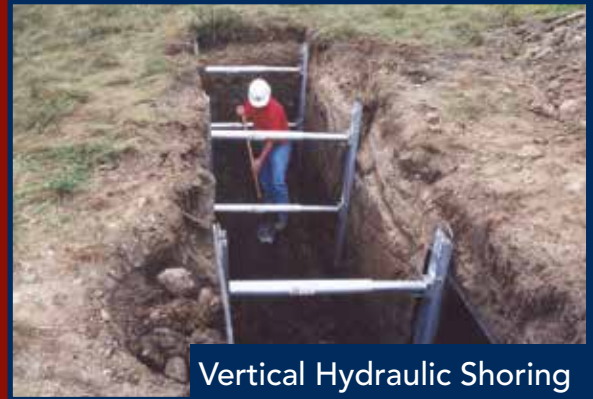
Vertical Hydraulic Shoring